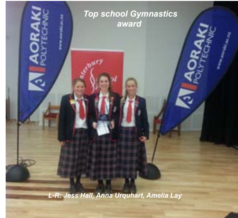
Top school Gymnastics award