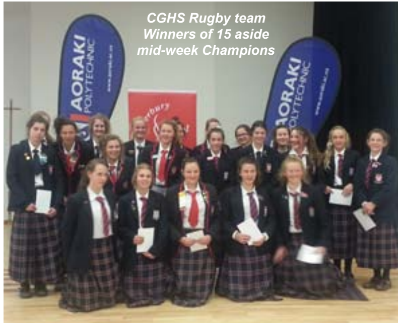
CGHS Rugby team Winners of 15 aside mid-week Champions