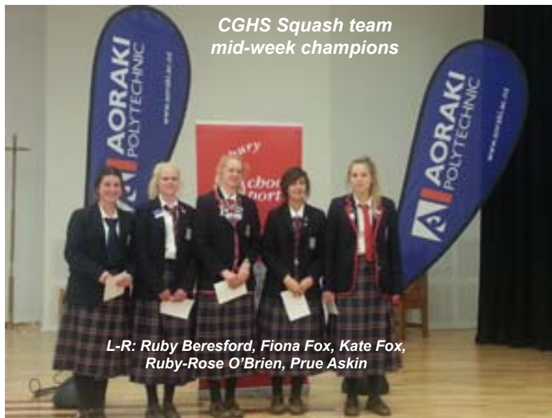
CGHS Squash team mid-week champions