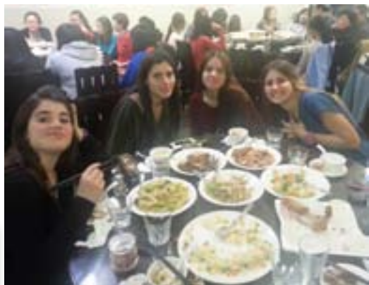
Welcome dinner at The Joyful Restaurant

once again seeing Christchurch as a viable destination for gaining a world-class education.