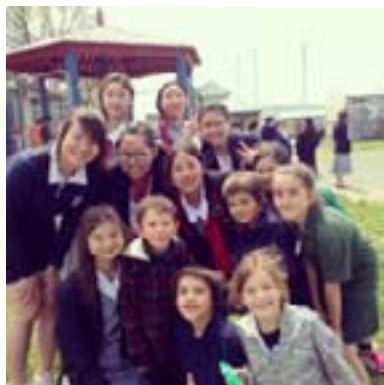
Phillipstown School visit

Source countries for CGHS have changed radically. This year we have welcomed ten new Chinese students and next year we will