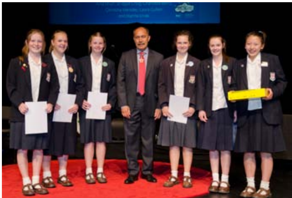
"Flower Corridor" - 1st Place, Year 9

After being selected as finalists we were asked to go to an empty lot to film a short video summing up our projects. Both teams spent half an hour filming our proposals to perfection. These videos were then collaborated with the other finalists' videos and then put on display in a container that had been 'jazzed up' for the public to view in Gloucester St.