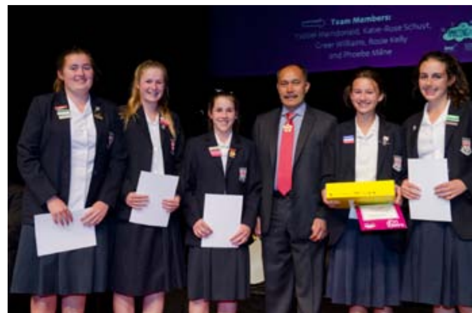
"Square Up" - 2nd place, Year 9