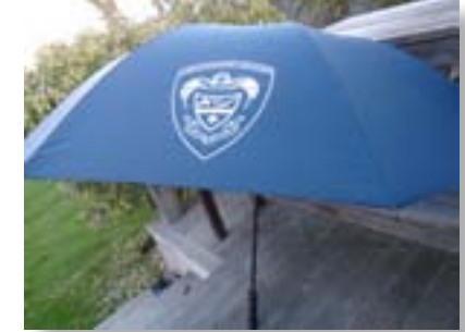
Golf umbrella - navy blue with white school crest - $35.00 Student mini umbrella - fold-up with push button release with protective sleeve - $25.00