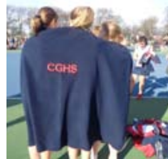
The Blanket is a good quality navy polar fleece with red stitching and school initials. $45.00

Support our school with these stylish new umbrellas and warm blankets. Perfect for the sporting field, A rainy, cold winter day or as a gift for grandparents!