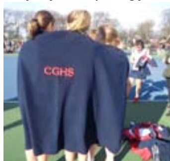
The Blanket is a good quality navy polar fleece with red stitching and school initials. $45.00

Support our school with these stylish new umbrellas and warm blankets. Perfect for the sporting field, A rainy, cold winter day or as a gift for grandparents!