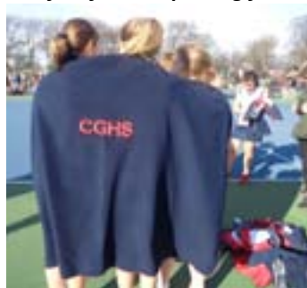
The Blanket is a good quality navy polar fleece with red stitching and school initials. $45.00

Support our school with these stylish new umbrellas and warm blankets. Perfect for the sporting field, A rainy, cold winter day or as a gift for grandparents!