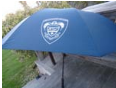
Golf umbrella - navy blue with white school crest - $35.00 Student mini umbrella - fold-up with push button release with protective sleeve - $25.00